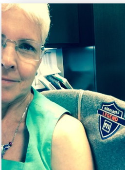
A Mimecast Legend and her exclusive hoodie

Jumpstarted by Legends' leadership, overall participation in the community grew over 3x in just two years