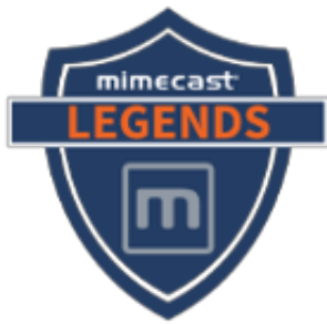
Dedicated badge for Legends